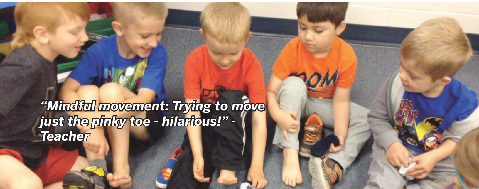
“Mindful movement: Trying to move just the pinky toe - hilarious!” - Teacher

When children engage in an activity they enjoy, their amygdala relaxes, cortisol levels decrease, and positive neurotransmitters are able to replenish; allowing the brain to return to a state optimal for learning.