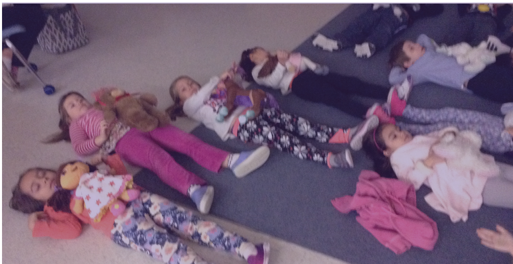
Children practicing a “Brain Break” Belly breathing with their breathing buddies.

“ I love hearing the kids talk to one another. I have heard things like ‘ Your amygdala is taking over, ’ and ‘ [Teacher’s name] I really need to move right now, ’ and ‘ I feel so good after a brain break ’ and ‘ I think we need a brain break. ’ The students seem to realize that they feel better when we take the time to get focused for learning.”