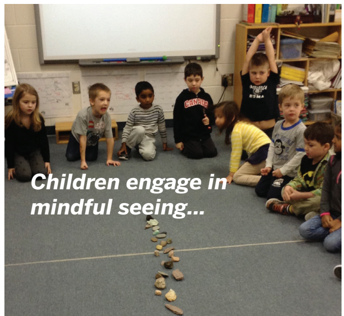
Children engage in mindful seeing...

“ We structured it so that after the focus lessons were delivered we took the time to ‘practice’ the language of the lesson and integrate it into the classroom. Once we felt that we had mastered a topic we would then proceed to the next focus lesson. Some lessons took more time than others based on students pre-existing knowledge, classroom’s pre-existing structure and teaching style of the teacher.”