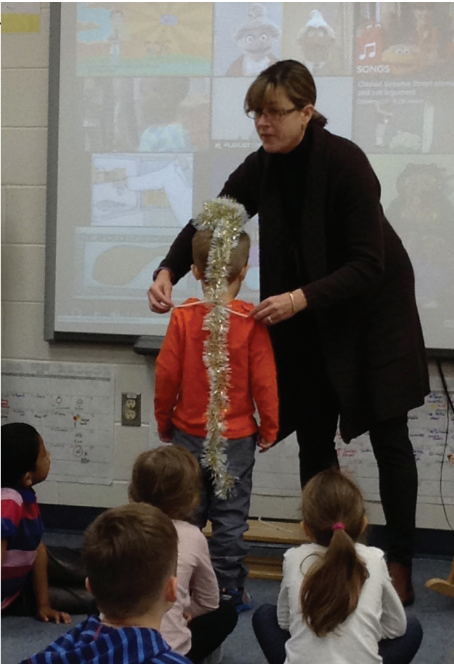
Extending the lesson: Teacher using Christmas garland as a visual to teach about the nervous system.