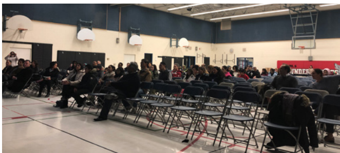
Erin Mills Connects in Mississauga hosts a presentation for their local community schools.

The Screen Challenge: Youth, Social Media and Safety is a 60 minute live presentation for parents (and interested educators) to help address current issues and conversation starters associated with youth engaged in social media. Customizable to each audience, the following related topics are available for discussion: cyberbullying, sexting, self-esteem, sleep, addiction, and mental health. It's time to take action on understanding how to have appropriate and encouraging conversations with youth about positive behaviours in the digital world. This engaging presentation includes up-to-date statistics, current popular social media apps, and new and upcoming trends.