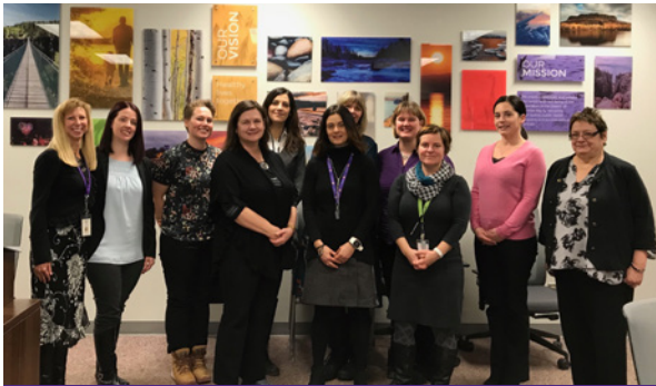
Team members from Thunder Bay District Health Unit and Centre for School Mental Health

Our team is excited to be starting a new partnership with the Thunder Bay District Health Unit (TBDHU) . TBDHU is spearheading a multi-year scale up project to bring the Fourth R to schools throughout the Thunder Bay district. They are working with Indigenous, community, and educational partners to make adaptations to the program to make it culturally relevant for their communities. They are partnering with the Centre for Rural and Northern Health Research at Lakehead University to document lessons learned. In January some of our team travelled to Thunder Bay to participate in their first stakeholders meeting and learn more about how we can support this exciting project.